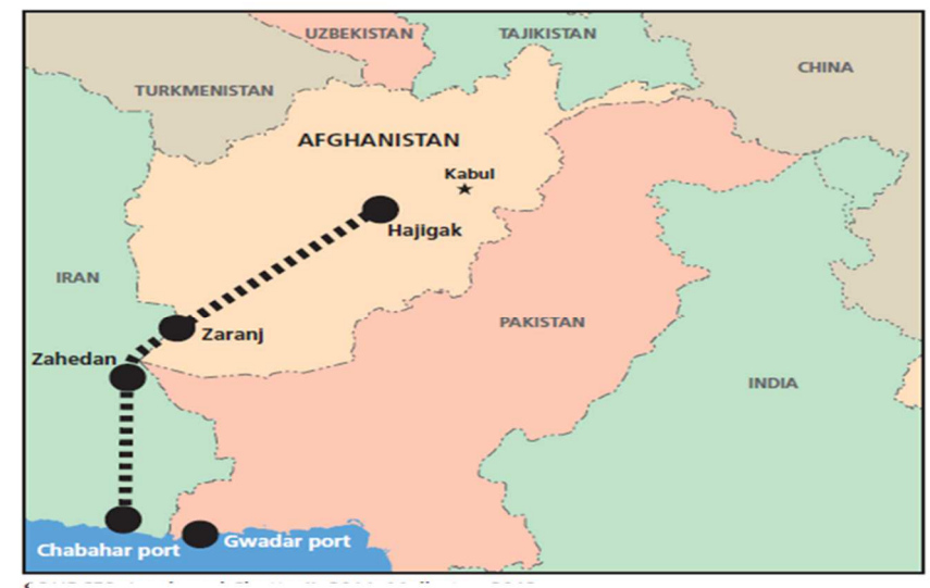
Figure 7. Chabahar route

Asia-Russia route, to the seas and enables it to counterbalance Pakistan's leverage and lessen the countries dependent on the Pakistani ports. Chabahar also can