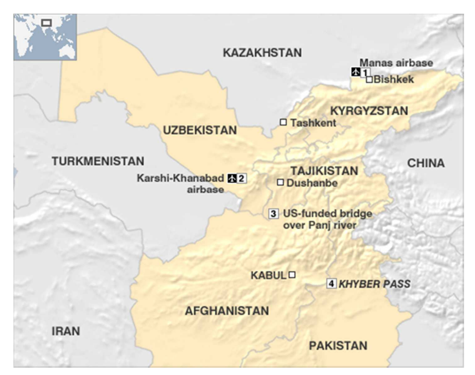
Figure 5. Uzbekistan, Karshi-Khanabad airbase

military supplies in the war in Afghanistan. Uzbekistan gave the facility to the United States to contribute in the war against terror without demanding money for it. This facility was considered very valuable in the early stages of war against the Taliban and Al-Qaeda in Afghanistan. The United States then-Defense Secretary Donald Rumsfeld called Uzbekistan a "stalwart" partner. The friendship went on to become Strategic Partnership in 2002 (Gealson, 2006, 52).