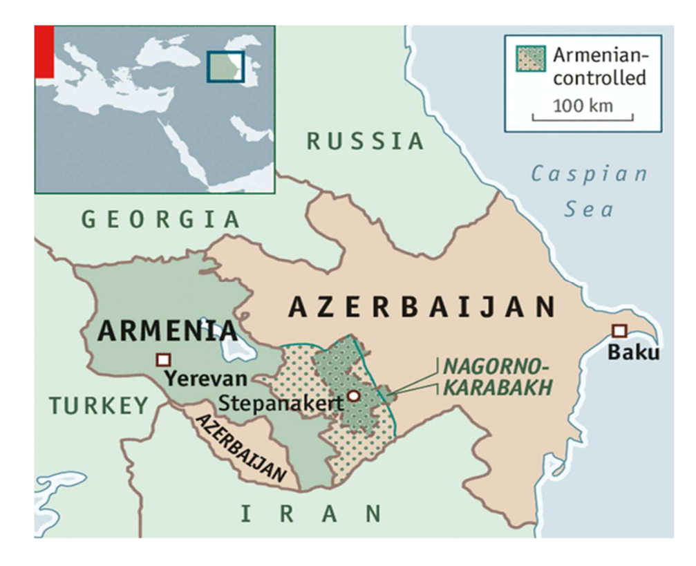
Figure 2. Armenia and disputed Nagorno-Karabakh

Foreign policy problems. In Armenia's National Security Strategy (NSS, 2007) the Nagorno-Karabakh conflict and Azerbaijan's probable aggression, as well as Turkish-Azeri blockade against Armenia, are considered the two main national security threats. The first was a territorial dispute with Azerbaijan which began in 1993. The second stemmed from the historical hostility with Turkey over the killings of Armenian ethnics by the Ottoman military during the World War I in 1915. Armenia, mainly under pressure of Armenian diaspora, pursues international recognition of the killings as genocide (Mirzoyan, 2010, 1). As a result, Armenia faces blockade by both neighbors. Azerbaijan has blockaded Armenian access to the Caspian Sea. Turkey has blockaded the routes to the Black Sea and Mediterranean markets.