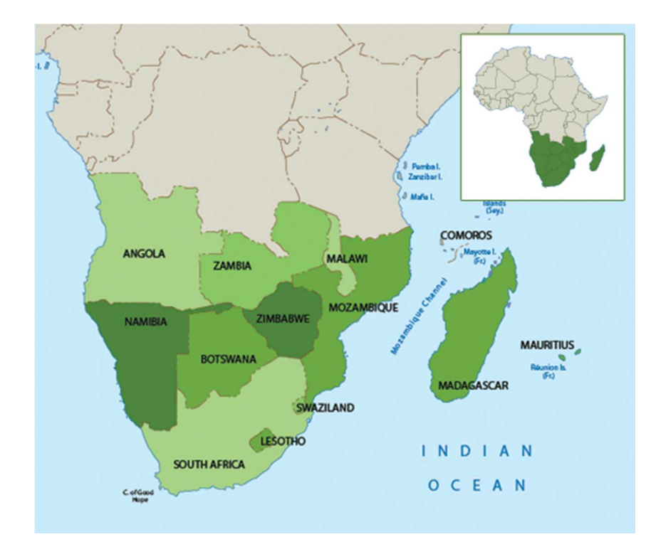
Figure 4. Southern Africa

management for its natural resources, especially diamonds. Botswana was fortunate enough to be resource rich and equally fortunate not to fall in resource trap (Collier, 2007, 73).